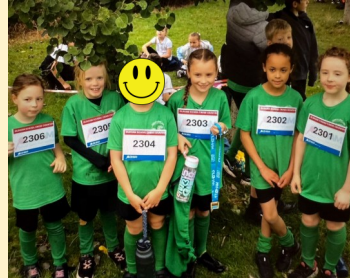
Super effort from our new Cross Country teams in Years 3 -6!