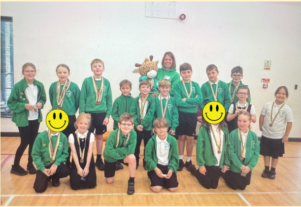
Well done to all of the children at our school who took part in the Saddleworth Olympics this year!